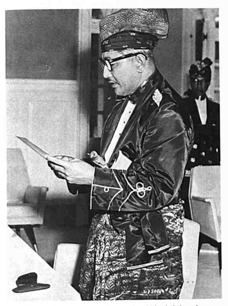
5 The swearing in ceremony of the author, Malaya's Independence Day, 31 August 1957. Tunku Abdul Rahman, the then Prime Minister, is seen in the background.